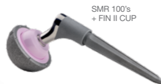
SMR 100's + FIN II CUP